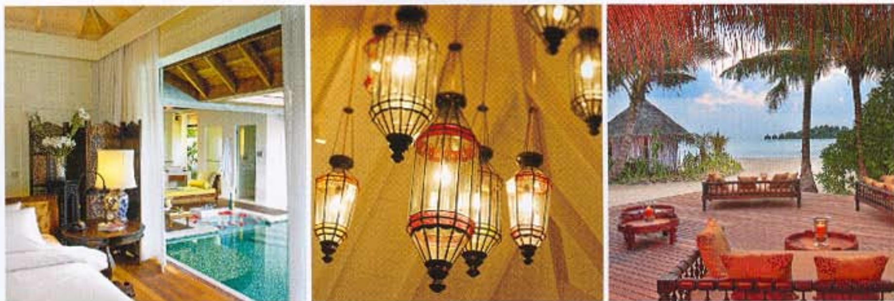
ROOMS WITH A VIEW Naladhu's elegant whitewash villas are open and airy, allowing guests to enjoy the picturesque surroundings

Designer Julian Coombs takes his whitewash inspiration from the faraway Bahamas, filling high ceiling interiors with classy cane furnishings, outdoor swings roomy enough for two and indoor divans for rainy days, then covers every plush surface in mood-lifting tropical textiles. Private infinity pools extend far beyond a mere plunge, while high-tech toys range from the iPod and Bose home theatre system with LCD satellite television to the requisite WiFi for those who need to stay connected to the realities of distant shores.